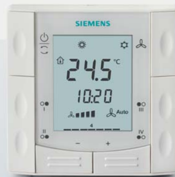
RDF301.50 – communicating room thermostat with lighting and blinds control