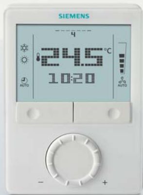
RDG range – for fan coil units and volume flow, also available with KNX communication