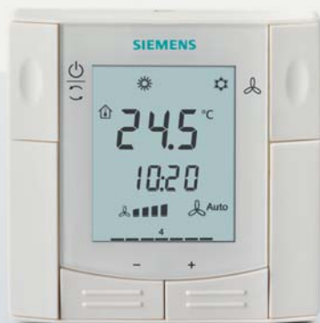
RDF range – for semi flush mounting with time programs for fan coil units, also available with KNX communication