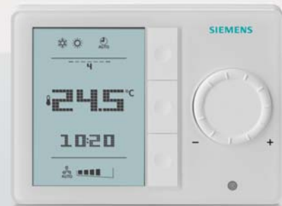
RDG100T/H – with time programs for fan coil units